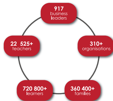
HOPE AND POSSIBILITY IN ACTION IN SOUTH AFRICA